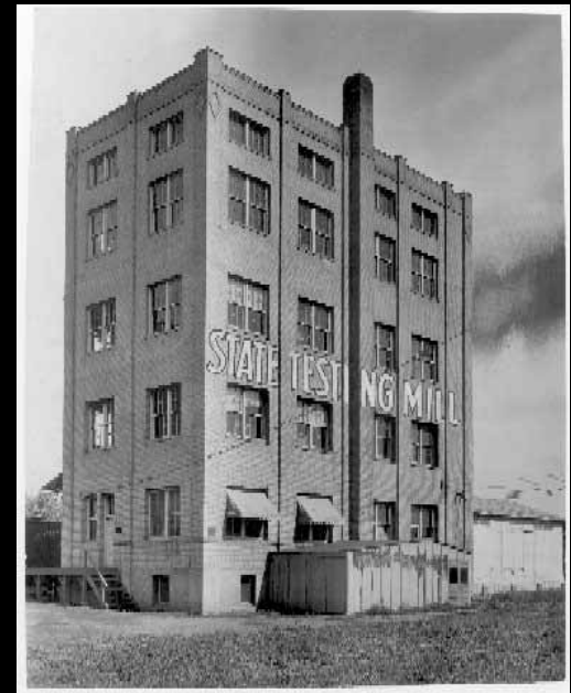
State Testing Mill ca. 1917