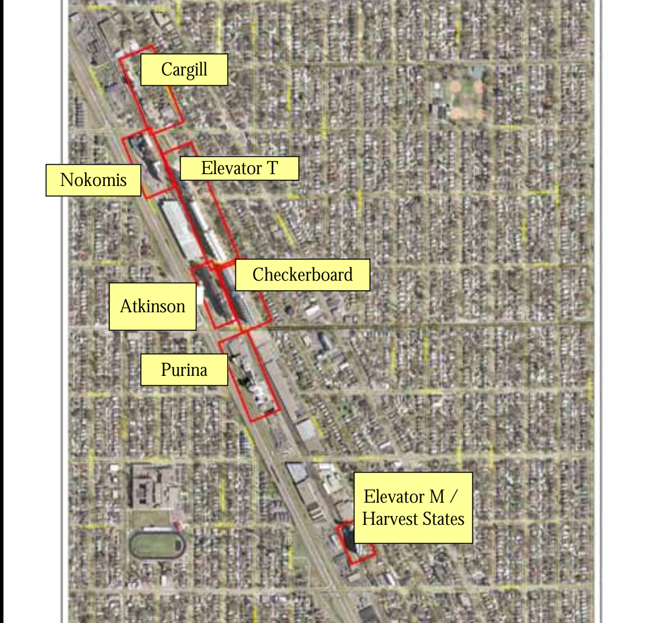
Seven Elevator and Mill Complexes : ca. 1902-1930