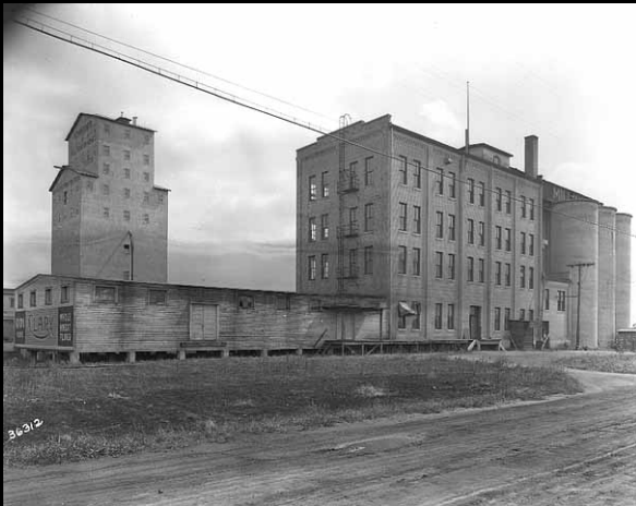
Schreiber (at left) ca. 1921