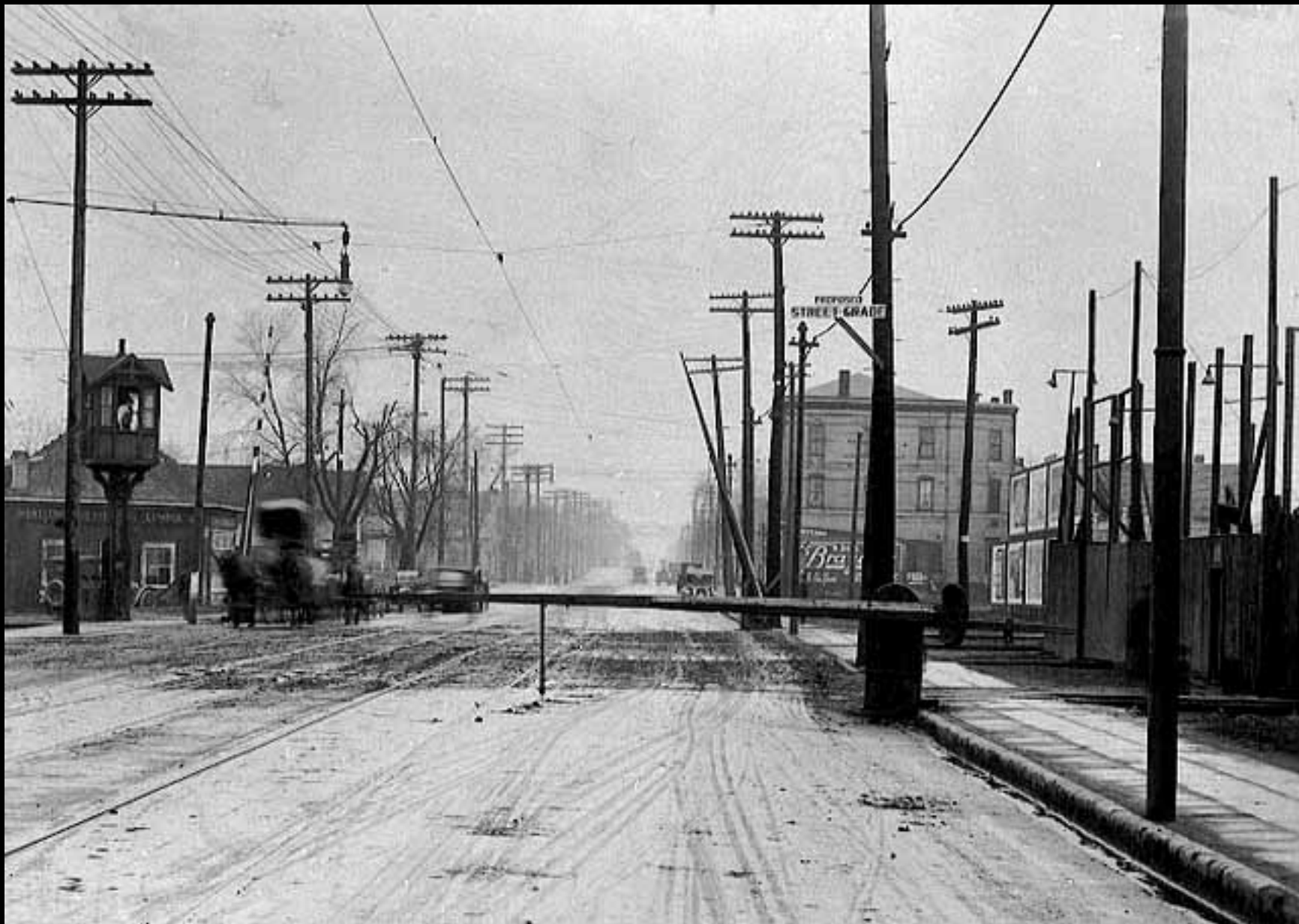
E. Lake looking west toward Hiawatha Avenue, 1920