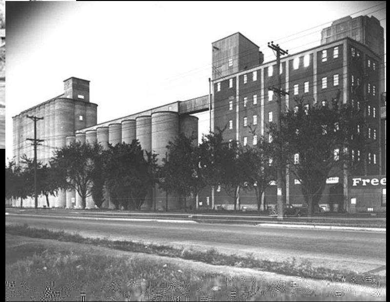
Hiawatha Avenue, ca. 1938