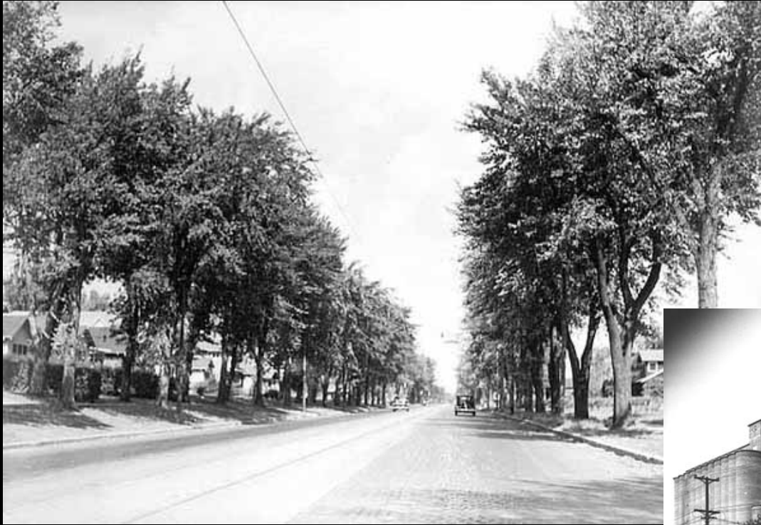
45th and Minnehaha, 1934