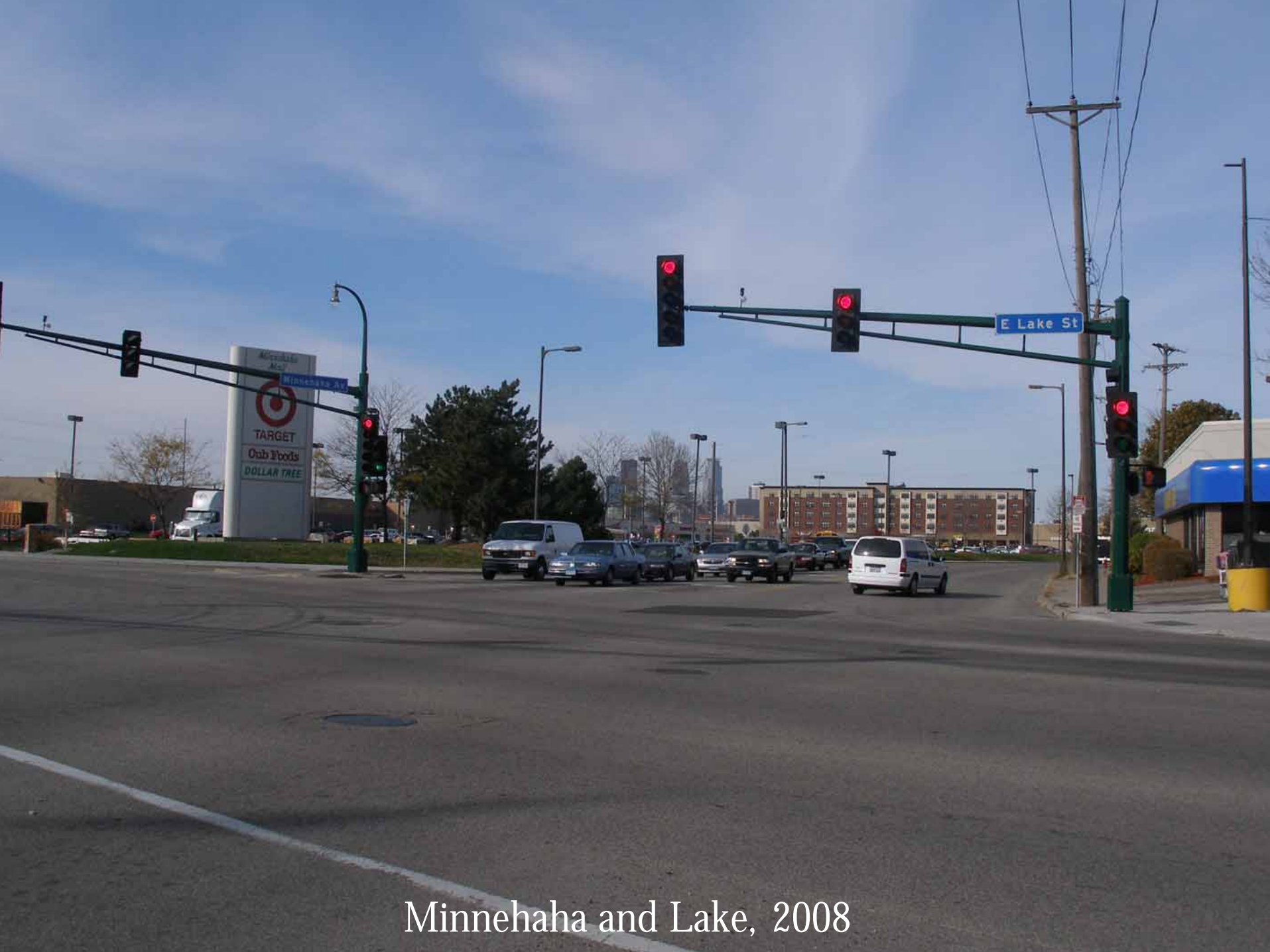
Minnehaha and Lake, 2008