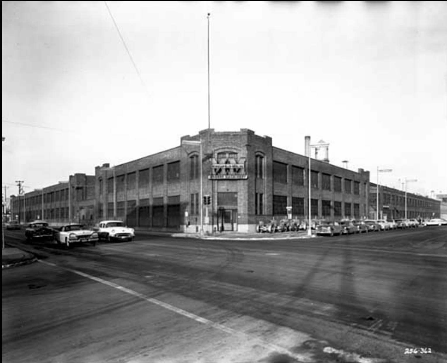
Minnehaha and Lake, ca. 1958