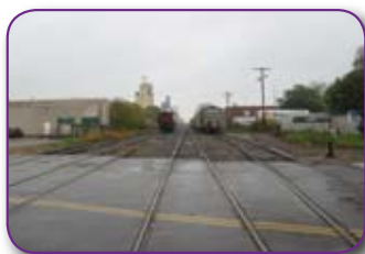
CM&StP Railway corridor

The existing stock of residential and non-residential buildings in the corridor includes approximately 87% that were built more than 50 years ago (1958), which is one of the minimum thresholds for a building to be considered for listing on the NRHP. Local designation does not always have this age requirement.