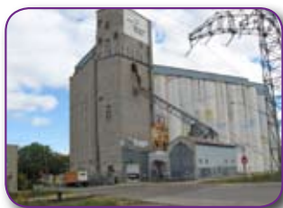
Grain mills & elevators along Hiawatha